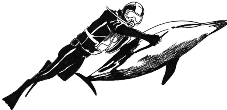
Figure 4 — A girl who was saved by a group of dolphins while she was snorkeling.