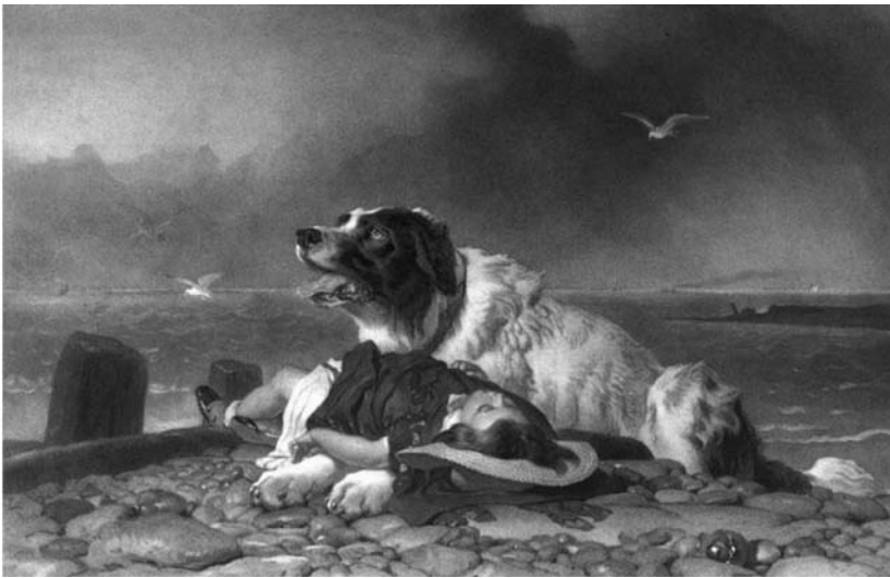
Figure 2 — A Newfoundland dog saves a young boy (Landseer 1802-1873).