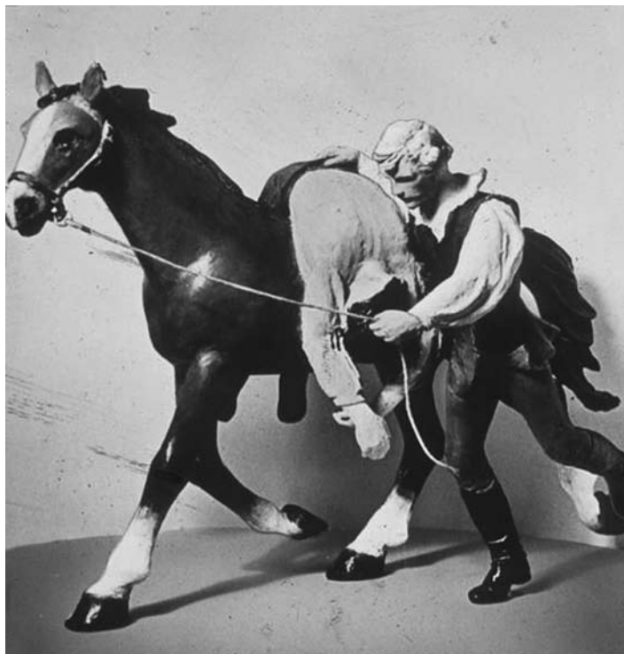
Figure 3 — The use of a horse for resuscitation. Taken from Dworkin, 1999, with permission.

horses for rescuing drowning casualties in poor remote areas where other means of rescue are unlikely to exist. More specifically, they suggested that a trained horse could swim up to the point where the victim is, having round its neck a rescue tube that the casualty could grab; however, as far as we know, no organization has used horses for rescuing humans.