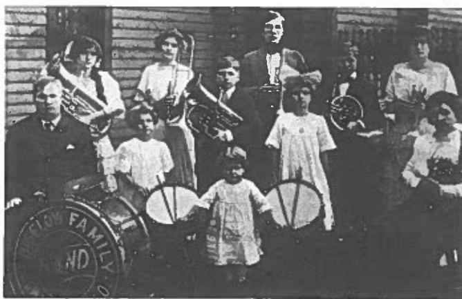
Bigelow Family Band (Bowling Green, Ohio) ca. 1914