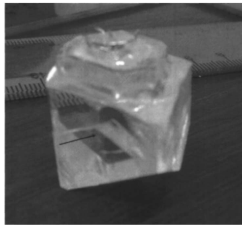
FIG. 3. As-grown KLuW crystal containing fractures with seed orientation along the c direction.

Table II lists the principal-axis parameters \alpha_I , \alpha_{II} , and \alpha_{III} and \phi for \text{KGd}(\text{WO}_4)_2 , 8 \text{KYb}(\text{WO}_4)_2 (Ref. 9), and KLuW crystals. In comparison with the values of \alpha_{III}/\alpha_{II} of KGdW and KYbW (8.3 and 6.5, respectively), the low value (2.8) for KLuW indicates that the thermal-expansion anisotropy is relatively weaker and thereby an optical-quality