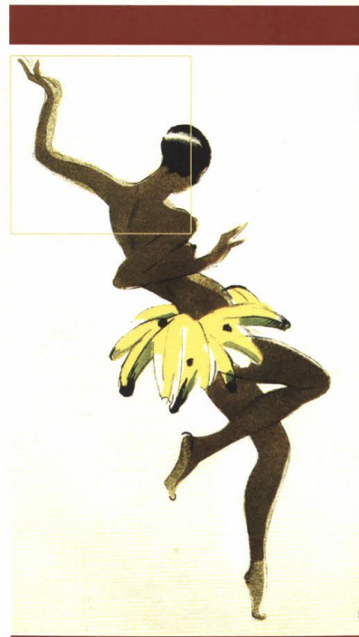
Paul Colin lithograph.