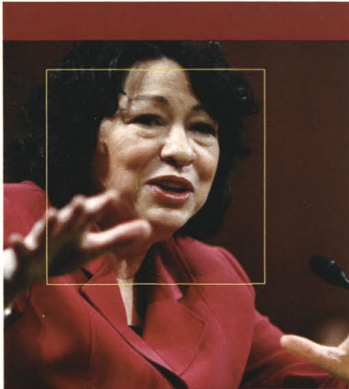
Justice Sotomayor, 2009 confirmation hearings.