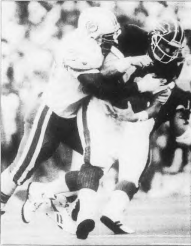
Miami Dolphins defensive end Marco Coleman sacks Buffalo Bills quarterback Jim Kelly during their game Sunday, Sept. 26, at Rich Stadium in Orchard Park, NY.