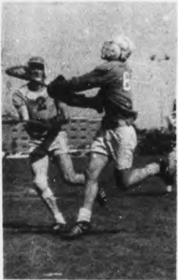
THE BG LACROSSE team just couldn't do anything right yesterday as Ohio State romped, 19-2.

The reputation that accompanied Ohio State to Bowling Green boasted of a tight defense, and an explosive attack, anchored by a sophomore who is setting all the nation's scoring records ablaze.