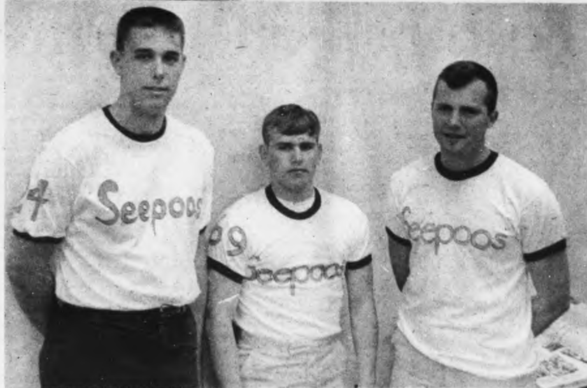
SEEPOO STARS. The three Seepoo leaders back from last year's championship team are,