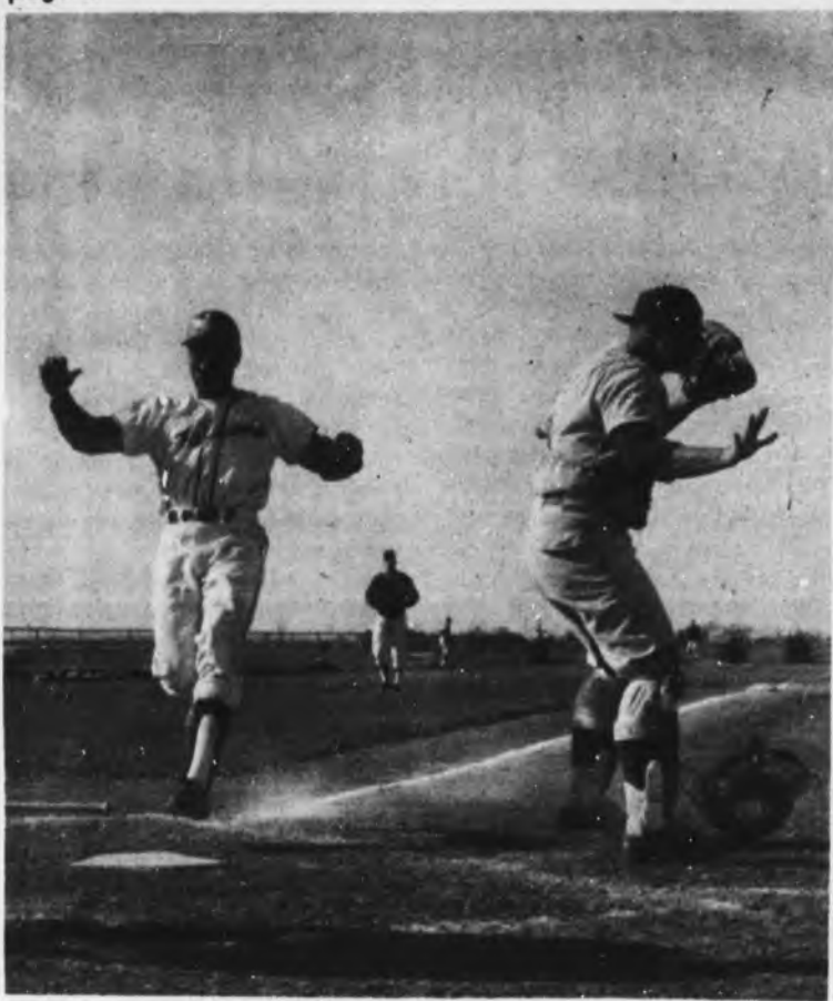
THE FALCONS SCORE! The Ball State catcher awaits the throw, but it's too late and a Falcon runner hits paydirt. The Falcons dropped the contest 9-6.