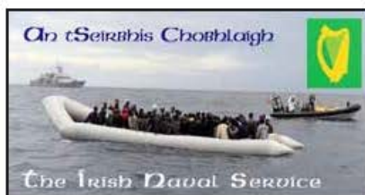
The Naval Service, Ireland