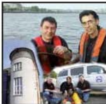
Foyle Search & Rescue