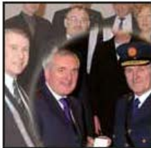
An Garda Síochána