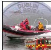
Dublin Fire Brigade