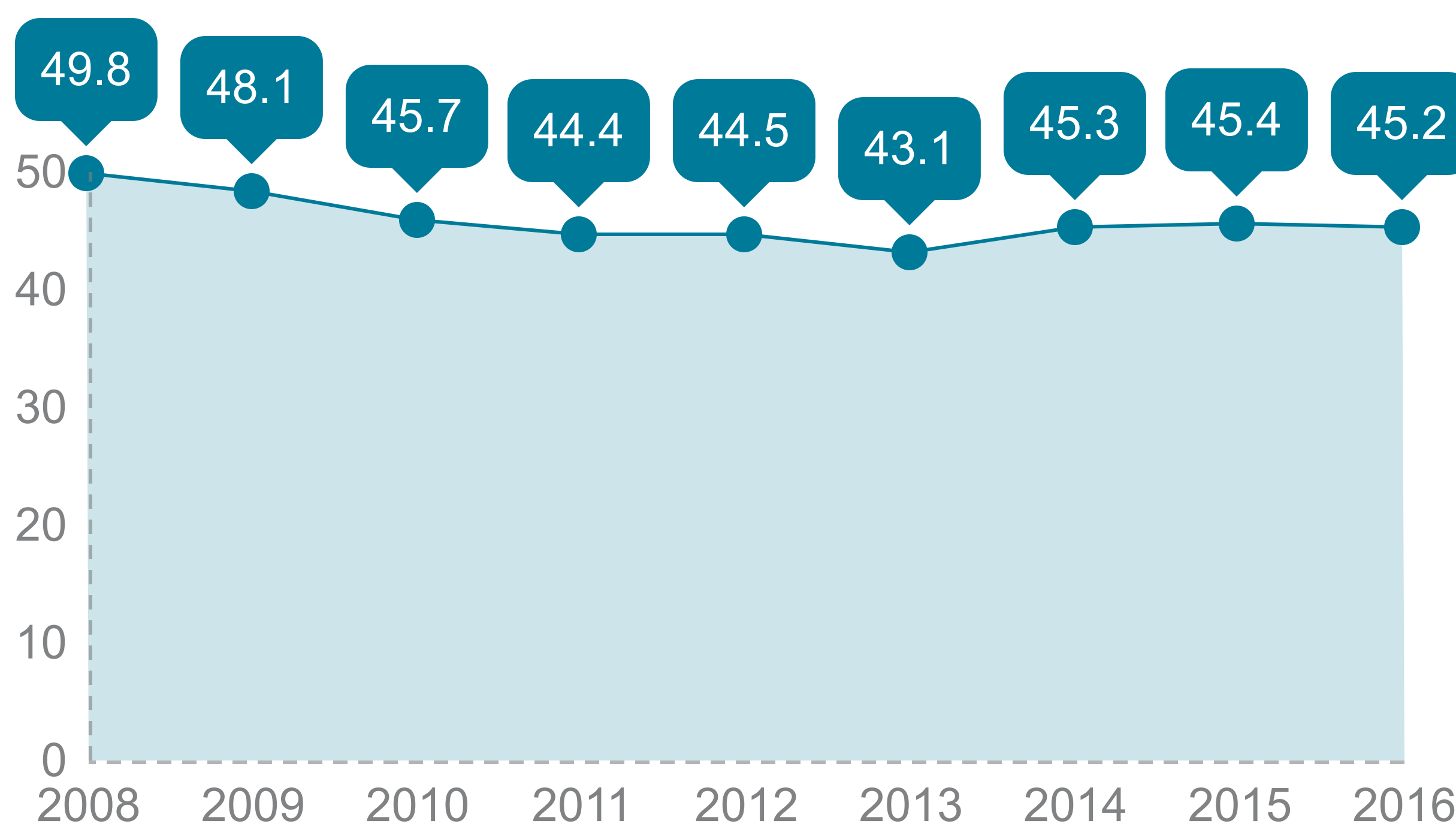
Figure 1. First Marriage Rate for Women 18 and Older, 2008-2016

Source: U.S. Census Bureau, American Community Survey, 1-yr. est., 2008-2016