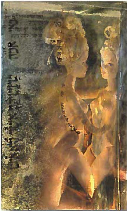
Barbie's Mikveh: Thank God for Making Me a Woman