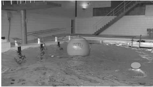
Figure 1 — Setup of wave-making ball.

200 m time trial. During testing, the swimmers were asked to swim 200 m breaststroke as fast as they could, but not with maximal speed at the start to minimize the effect of “a too fast start and inability to finish” for those swimmers who were less accustomed to this distance. They were instructed to prioritize finishing the distance while swimming as fast as they could for the entire 200 m. All swims were timed using a video camera (Sony HDR CX730E, Sony Inc., Japan) with a time-code overlaid on the recording. In addition to the 200 m finish time, lap times for each 50 m lap were recorded, as well as the time required to complete each turn at 50 m, 100 m, and 150 m, recorded as the time between the hand-touch and the toe-off from the turning wall.