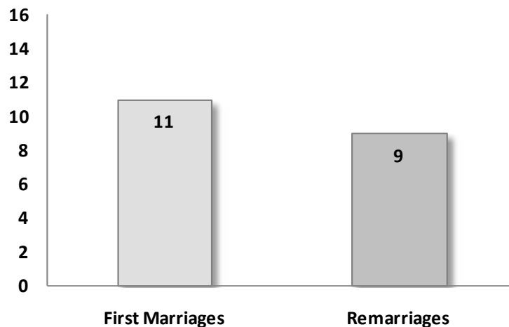
Figure 1. Median Duration of Marriages at Time of Divorce Among Women Aged 15 and Older by Type of Marriage, 2010

Source: U.S. Census Bureau, American Community Survey, 2010