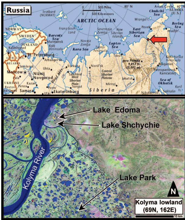
FIG. 1. Locations of lakes assayed. All of the lakes are in north-eastern Siberia, near the Kolyma River (indicated by large arrow on upper map). The lower satellite view shows the locations for each lake (indicated by arrows). Hundreds of lakes cover the Kolyma River delta region. Most, including Lake Park, are in the flood plains of the rivers and rivulets. Some of the lakes, including Lake Edoma and Lake Shchychie, are on an elevated area above the flood plain.

ice for more than 6 months annually and are frequented by large populations of migratory waterfowl, some of which travel to North America and others that travel as far as southern Asia, Europe, and Africa.