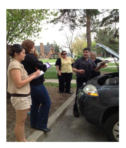
Learning how to become an empowered car owner and taking notes.