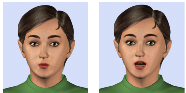
Nonmanual OO – “small size” Nonmanual CHA – “large size”

information. Figure 1 shows the adjectival nonmanuals OO (small) and CHA (large) demonstrated by our signing avatar.