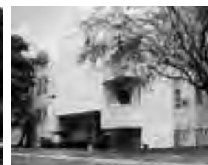
Piedmont Apartments 8th & High St.