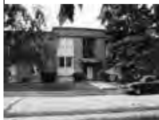
Birchwood 650 6th St. (Small pets welcome)

Find a Place to Call Home (1 Bedrooms, Houses & Mini Storage Available)