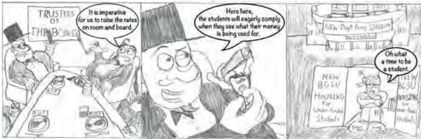
COMIC BY ZACH FERGUSON