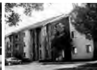
Fox Run Apartments 216 S. Mercer Rd.