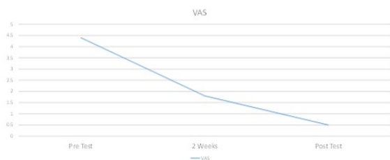
Figure 1: VAS data collected from the subject before the training schedule (pre-test), at 2 weeks into the training schedule, and after the 4-week training schedule (post-test).